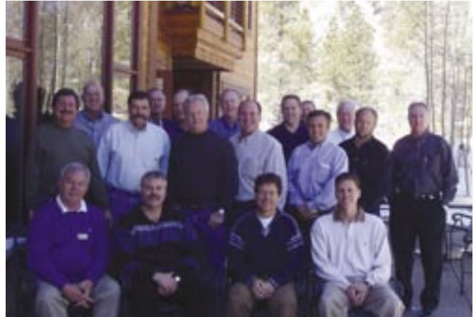
CAPA Board of Directors Planning Retreat, Breckenridge April 2005