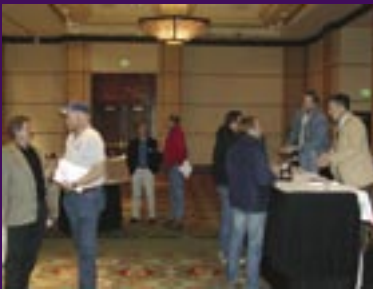
There was plenty of discussion raised by the comments of each of the panelists.