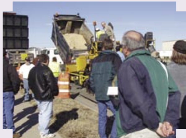
The conference included a successful outdoor equipment demonstration that was hosted by the City of Aurora.