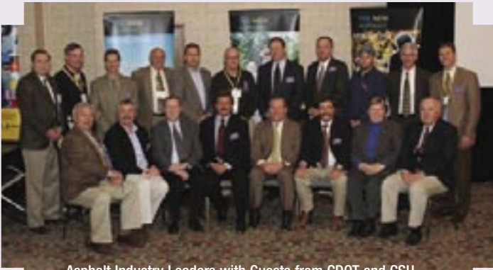
Asphalt Industry Leaders with Guests from CDOT and CSU.