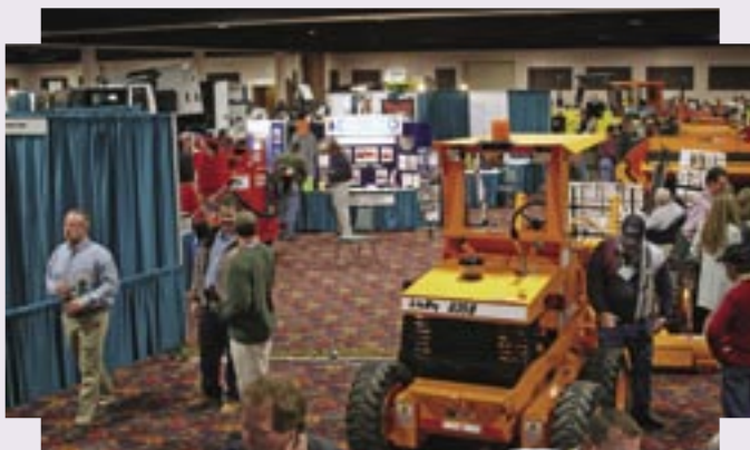
Over 1,400 attendees, speakers, exhibitors, and staff helped make the 32 nd Annual Rocky Mountain Asphalt Conference & Equipment Show a success.