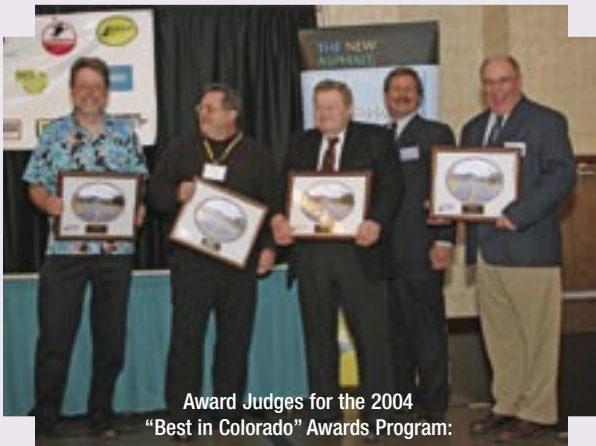
Award Judges for the 2004 “Best in Colorado” Awards Program: