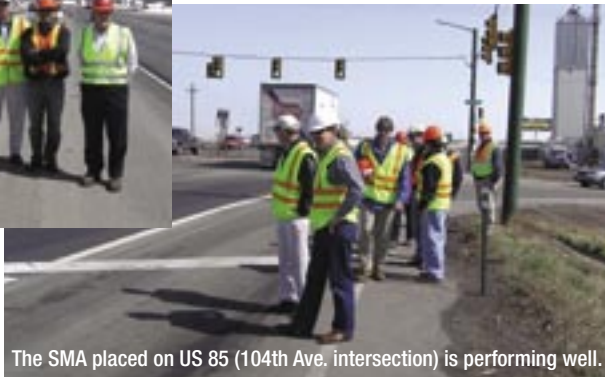
The SMA placed on US 85 (104th Ave. intersection) is performing well.