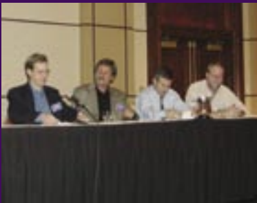
Safety, Quality, Cooperation, and Productivity were the topics of discussion by the contractor panelists.

On the surface it seems very straight forward; project success being directly related to project safety, quality, cooperation, and productivity. However, the difficulty comes in trying to communicate these principles effectively to all parties involved in a project – contractor personnel and owner/agency representatives alike. This was the challenge CAPA was presented with earlier this year when it agreed to coordinate a contractor panel presentation for both the annual APWA – Colorado Chapter Inspectors Conference and the 32 nd Annual Rocky Mountain Asphalt Conference & Equipment Show .