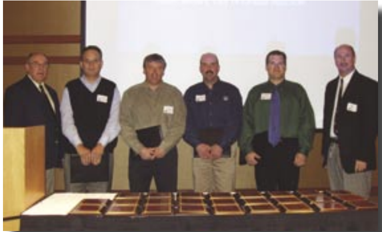
The Asphalt Technology Scholarship recipients were recognized at the 2005 APWA Awards Luncheon held earlier this year.